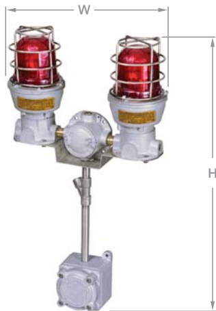
Double light - Conduit mounting