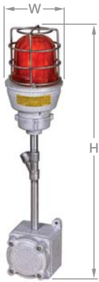
Single light - Conduit mounting

Dimensions shown are within manufacturing tolerances